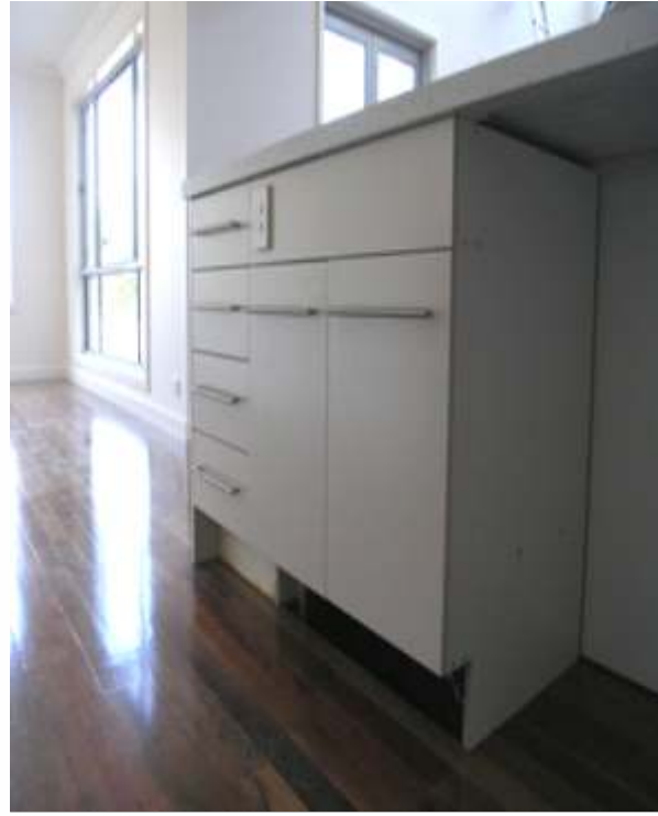
Under Bench series